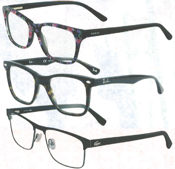
Selection is representative of brands we typically carry in our optical centers. 3

Or use your $175 benefit toward contact lenses.